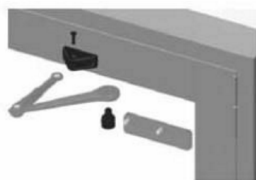
PULL Mounting Hardware Non-Handed Regular Arm