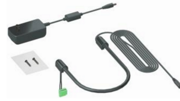
ADA1015P Hardware Kit: 24 VDC Transformer Armored Door Cord w/ End Links 50 ft. of Low Voltage Cable Power Port Connector