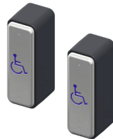
Narrow Style Push Buttons (2) Heavy Duty - Stainless Steel 1 3/4" x 4 1/2" Jamb Mount Weatherized Wireless (RF) Transmitters